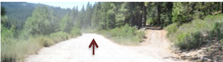
1.2 mile from gate; stay forward 3c