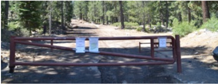
Donner Park Gate 2

*If the gate is locked, access the canyon through the main Donner Park entrance, just west of Coldstream Rd on Donner Pass Rd. Tell the person at the kiosk that you're staying at the Lost Trail Lodge to avoid paying Day Use fees.