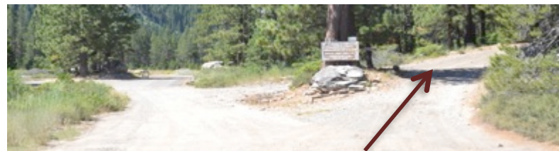
1.5 mile from gate; turn right 3d