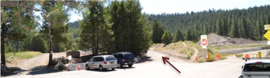
Winter Parking, looking east at Coldstream Rd 1