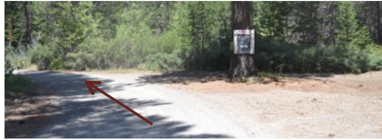
2.6 miles from gate; veer left 4b