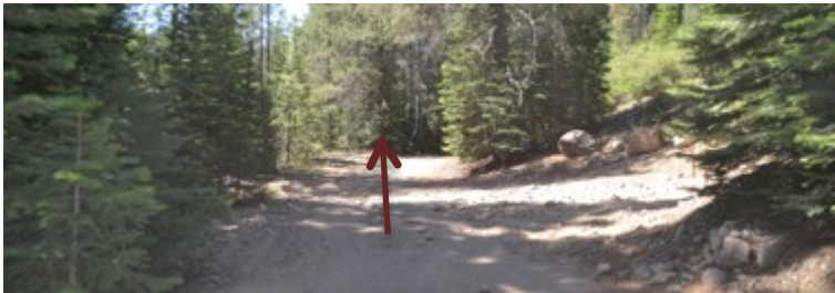
<0.1 miles from tracks. Do not turn up hill 7a

7. Travel south on the level road 0.3 miles to the lodge