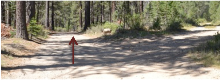
2 miles from gate; stay forward 4a

4. Continue up and over the hill. Follow the main road another 1.3 miles to the Summer Parking area.