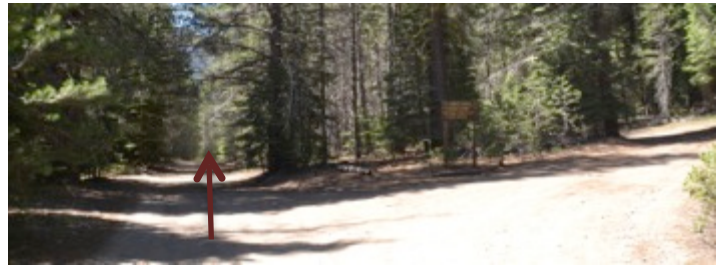
0.1 miles from tracks. Stay forward for summer access 7b

8. Parking area is to the right, just past the tipi.