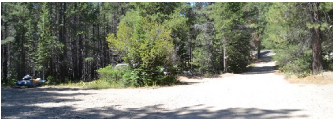
Summer Parking 4

STOP and park here. Walk the last ½ mile to the lodge.